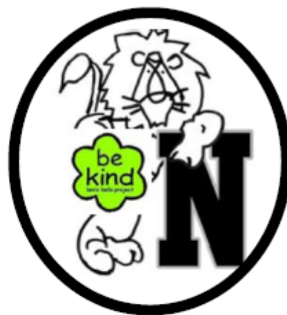
Logo on PopSocket